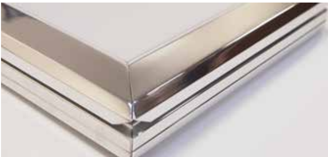
Bright Polished Hand finished to a high gloss shine