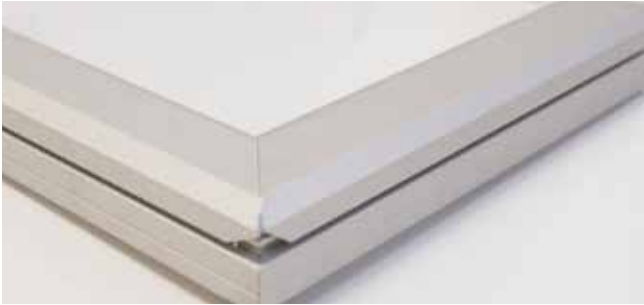
Silver anodised Standard frame finish