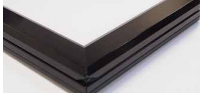
Painted Satin, matt or gloss